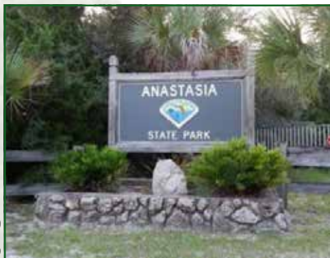
Anastasia State Park