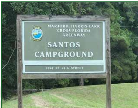
Santos State Park