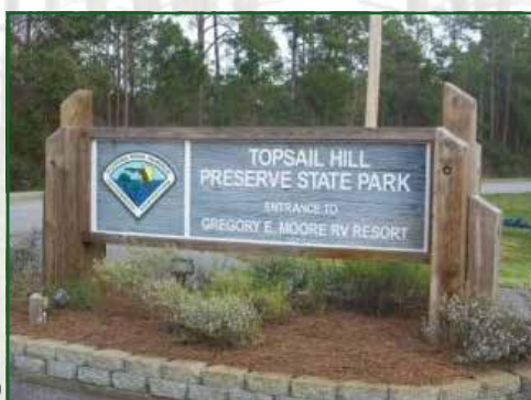
Topsail Hill Preserve State Park

Click Here For Our Exciting State Park Events