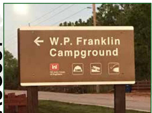
W.P. Franklin Campground