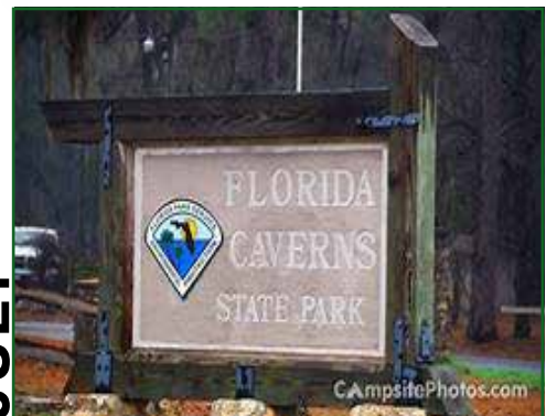
Florida Caverns State Park